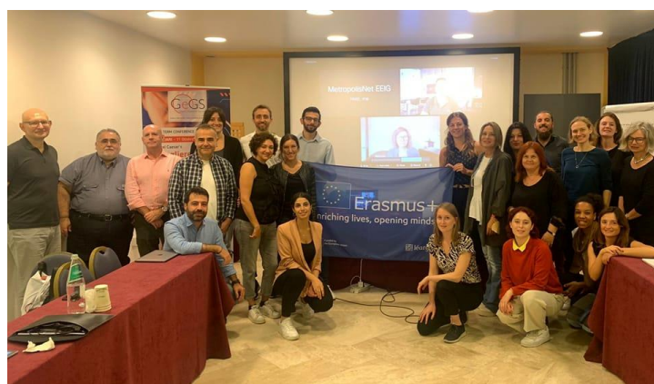
FIGURE 2 GEGS TRANSNATIONAL PARTNER MEETING OCTOBER 2022

The GEGS field trials were carried out in 3 regions (Thessaly, Sardinia and Berlin) with the involvement of the public authorities, also conducted simultaneously in Ireland, France and the UK, which acted as control testing countries. The piloting implementation in each country was carried out using different methodologies to best suit the specific needs of their own practitioners and the IAG services context, which ensured usability and richness of the discussions and transferability scope of the curriculum and Good e-Guidance Stories or case studies developed. A further strength of the course that was highlighted was the richness of the materials offered and the opportunity for IAG staff to discuss shared opportunities and challenges that they face with respect to digitalisation.