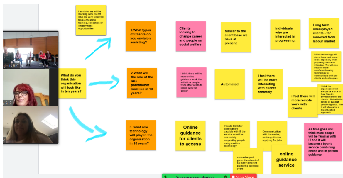
Screenshot #3: Example field trial GeGS pilot delivery to Community of Practice: local members from Ireland.

Another critical point was the technical difficulties experienced by some of the participants in accessing and using the Moodle Learning Management System, but nevertheless, they really appreciated the possibility to become more and more familiar with the topic of digitalization.